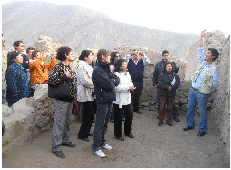
At an archaeological site near Lima (Perú)

Then same month, from the 17<sup>th</sup> to the 20<sup>th</sup>, the last course took place in Lima, Perú, in cooperation with the Universidad Nacional Mayor de San Marcos, and in particular with the Facultad de Educación and the Facultad de Ciencias Físicas. We created the 'WG NASE Perú' with five members who cooperated with the NASE foreign members, and taught the astronomy course to thirty primary and secondary school teachers.