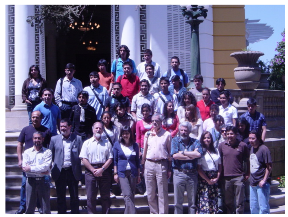
Most of the students and some of the staff at the TAD school in Bolivia

In line with the IAU policy of encouraging astronomy for its own sake, and as a tool for all kinds of development projects in the developing world, my view as a result of this experience is that Bolivia would respond well at ground level to an initiative from the IAU to introduce astronomy teaching at all levels within the general curriculum. Whether this would receive an adequate response at government or local authority level is harder to assess, but conversations with university staff in the Physics Department at the UMSS (Cochabamba's public university) gave me some hope that it would be worth while initiating high level contacts, and I would be prepared to try to follow up on this initiative if given encouragement and the relevant direct support from the IAU.