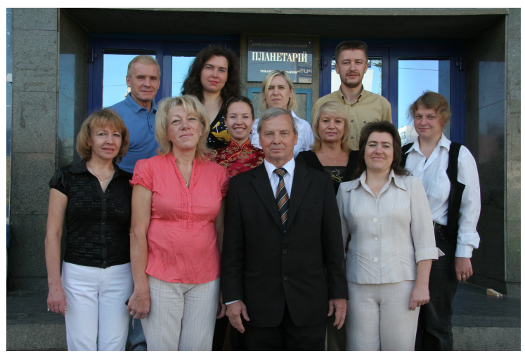
Staff of the Kiev Planetarium

The Planetarium has an Astronomy School that is attended by children 5-12 years old. This is quite unusual, since as a rule out-of-class astronomical activity concerns pupils with of about 11-12 years.