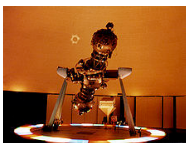
The Planetarium apparatus, the Zeiss projector

Today the Kiev Planetarium is one of the biggest in Europe. The stellar hall has a cupola 23 metres in diameter, and a height of 11.5 metres. At the centre of this building there is the main apparatus, The Grand Zeiss.