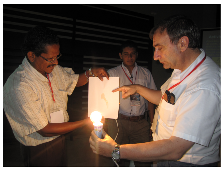
Students in Nicaragua performing the Bunsen grease spot experiment to compare the luminosity of two light sources

The second course was in Managua, Nicaragua, 11-15 July, in cooperation with the Universidad Autónoma Nacional de Managua, and the Observatory of Managua. The 'WG NASE Nicaragua' has been created with six members who worked as instructors in the 2010 course, and they will be responsible for organizing courses in future summers. The full number of participants in the course was fifty six from all the different parts of Nicaragua. There were secondary and primary school teachers and professors from education faculties in the university.